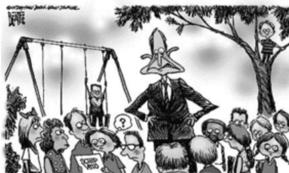
"You want medical care from the government? Try joining the Army!"

During a break in the hearings, Representatives returned to the House session in progress to speak out against the war budget, and to separate money for domestic programs from war funds.