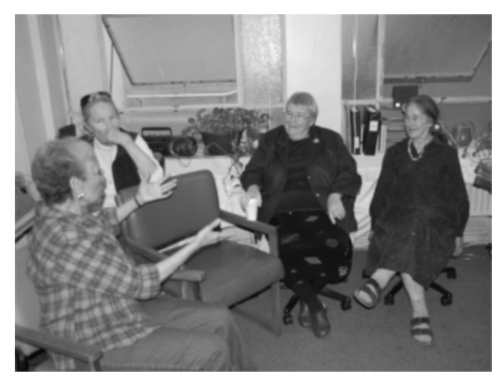
Civil Liberties Brunch—Great Food

"When the people lead, the 'leaders' will follow." We can stand together. We can stand up individually as did a librarian who said NO to the FBI demanding names. The conclusion of Standing up to the Madness calls out, "Speak truth to power. Fight for those who can't. Demand peace, and end the bloodshed. Stand up to the madness." This book can be borrowed from the GP library. Amy Goodman speaks in SF on Nov. 15 (see page 6).