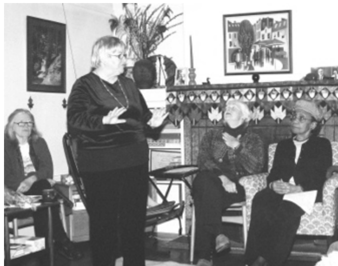
Lynne Stewart speaking at a San Francisco Gray Panthers fundraiser