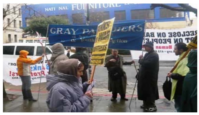
Jan. 20, Van Ness and Geary, fighting CMPC's Projected hospital for the 1% on Cathedral Hill.