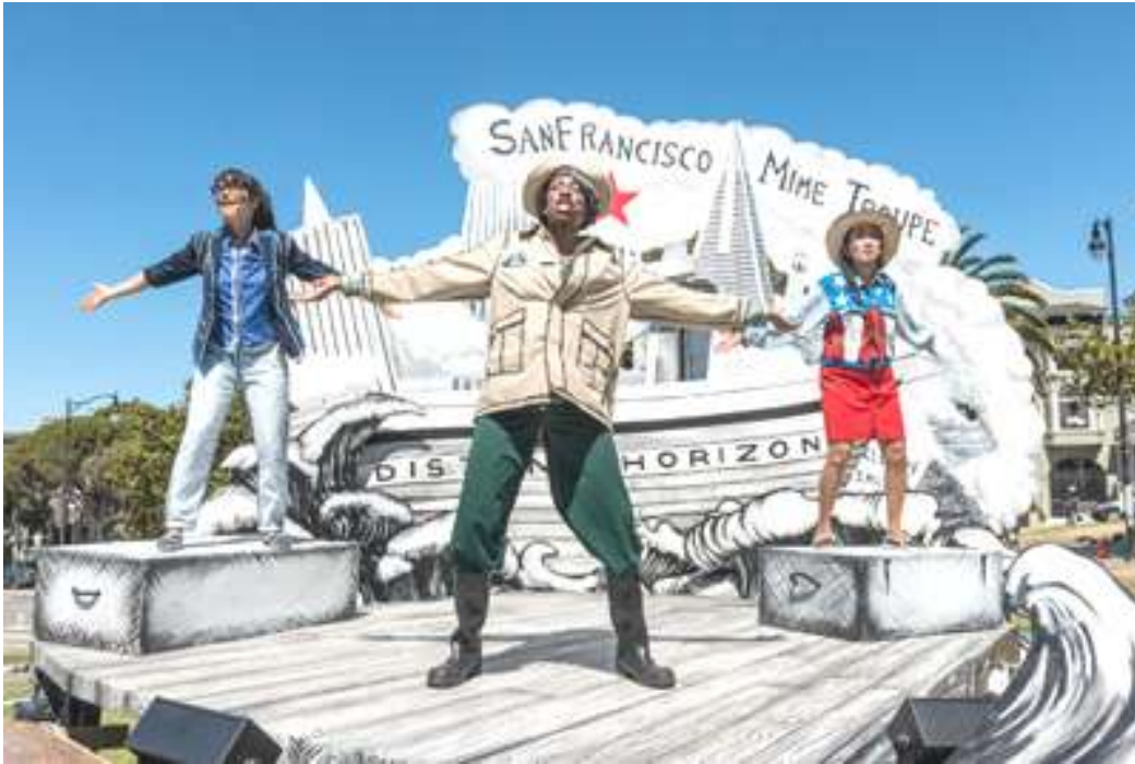
A scene from the play, Ripple Effect