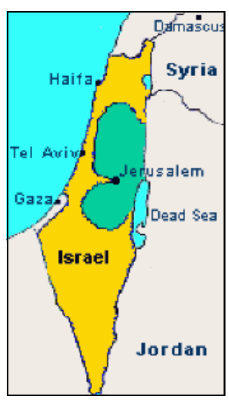
The U.S. Congress just gave $225 million in military aid to Israel.

Our Board discussed the crisis in Gaza and passed a resolution endorsing the "Block the Boat" action at the Oakland Port to stop weekly Israeli Zim ships from unloading cargo. We emphasized distinguishing among the Jewish people, Zionism, and the current extremist Netanyahu government so we do not fuel