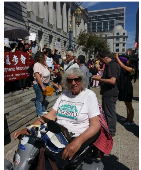
Including Gray Panthers