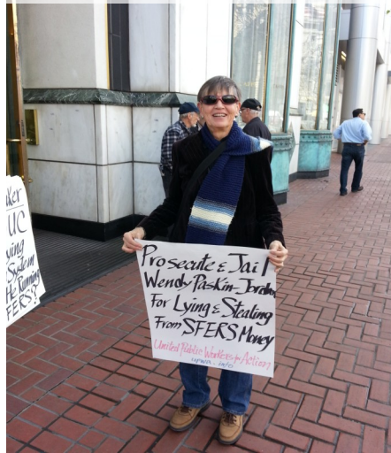
Gray Panther says "No hedge funds in our retirement fund!"