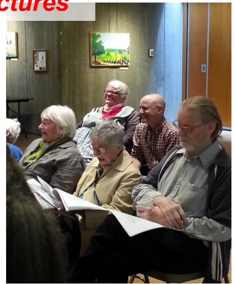
A Gray Panthers meeting on affordable housing measures