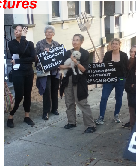
Friends of Gray Panthers on North Beach tour of evictions.