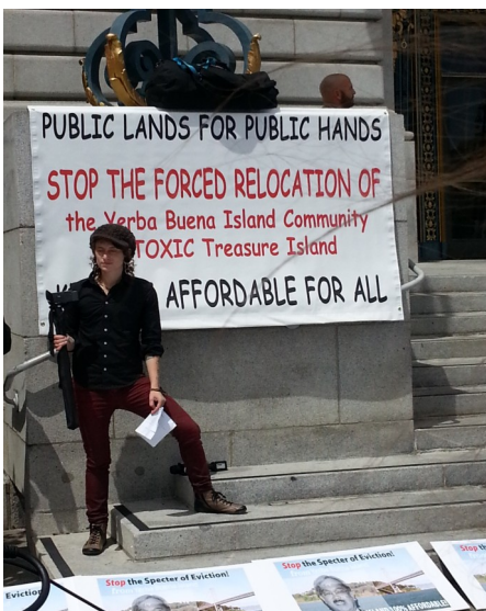
SF owns Yerba Buena Is., but gave it to luxury developers