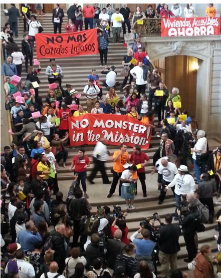
Thousands occupy City Hall demanding affordable housing