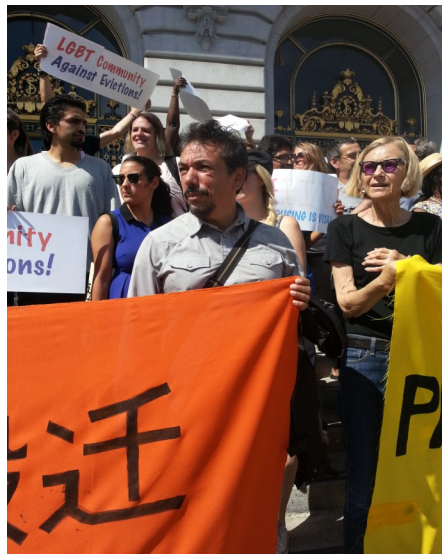
A huge number of community organizations were there