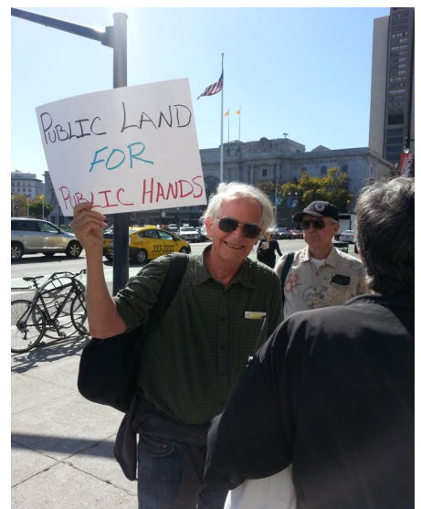
Gray Panthers: We need Yerba Buena Is. for OUR housing!