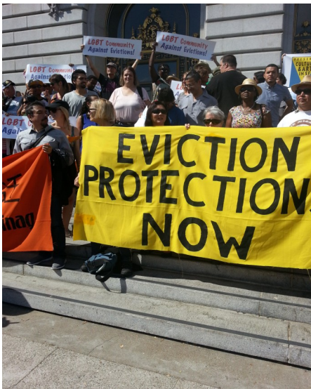
Still another demonstration against evictions