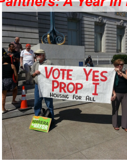
Gray Panther at rally to stop building luxury housing