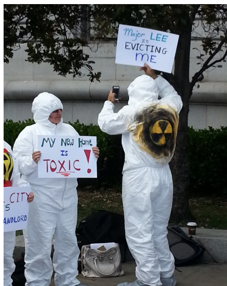
Treasure Islanders residents are sick from radiation