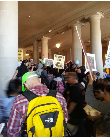
Black Lives Matter at City Hall: Stop Killing Us!