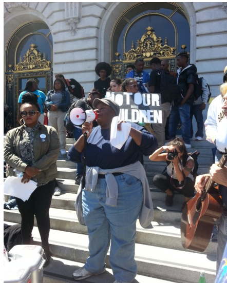
Gray Panther convener at Black Lives Matter action