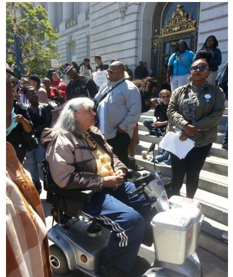
Another Gray Panther at the Black Lives Matter action