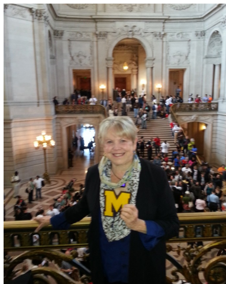
GP member and photographer at the housing occupation