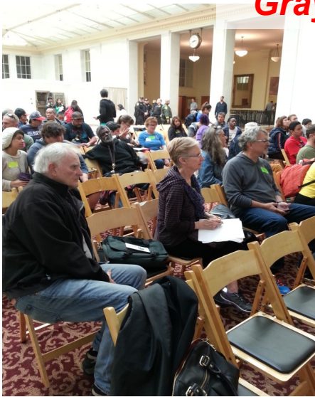
Friends of Gray Panthers at a Mission Moratorium hearing