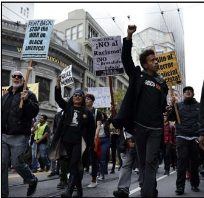
July 8th: youth-led march blocks off Market Street in protest of police killing of Philando Castile in Minnesota and Alton Sterling in Baton Rouge.