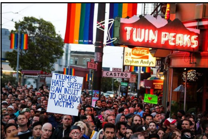
Vigil on Castro in response to Orlando shooting

Denise continues, “Remember: U.S. is not only fueling wars but is also giving or selling billions of dollars worth of weapons to regimes that abuse, torture, and kill their own people. These regimes also single out those of the LGBTQ community. We are all complicit when we don't call out our government's foreign policies and those of its undemocratic allies or those who claim to be democracies but use apartheid tactics.”