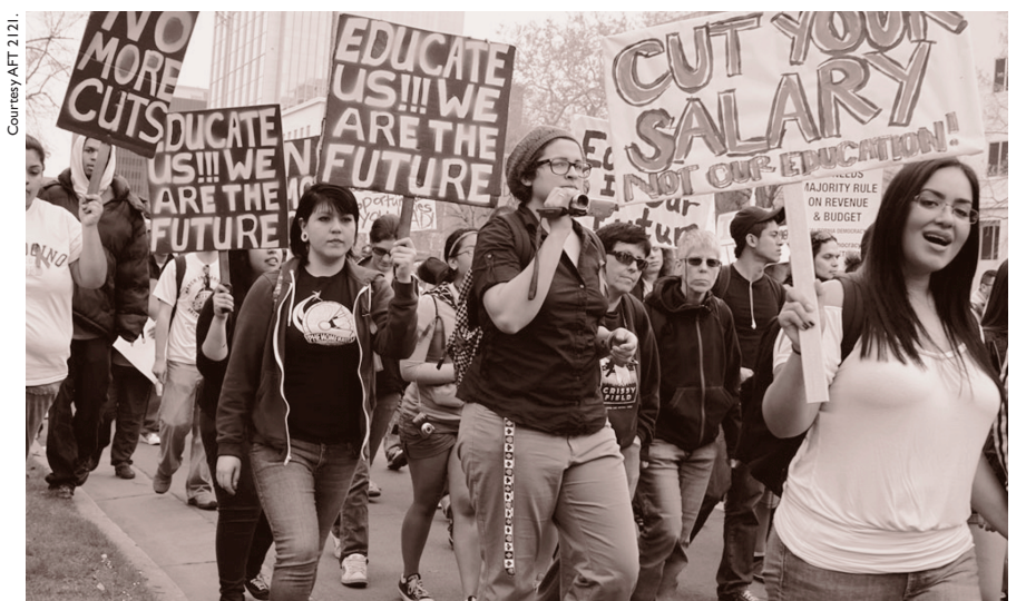
Students and staff march in Sacramento to restore school funding and cut excess executive pay.

*MWF, 11:00 a.m.-12:00 p.m., Statler Wing Room 2, Ocean Campus, 50 Phelan Avenue. *3 units, meets the following requirements: Core class for department certificates and major, CCSF Areas D and F, CSU United States History and GE Area D6, UC and IGETC Area 4F. Honors credit option.