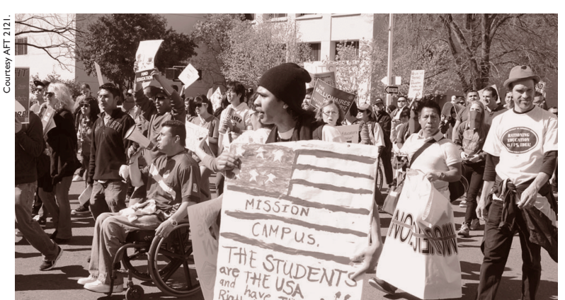
The Mission Campus at the March in March - ¡Presente!