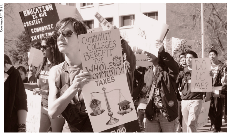
On the Sacramento March in March, students defend the community colleges

*3 units, meets the following requirements: Core class for department certificates and major, required class for Culinary Arts and Hospitality Studies, CCSF Area D and CSU Area D7.